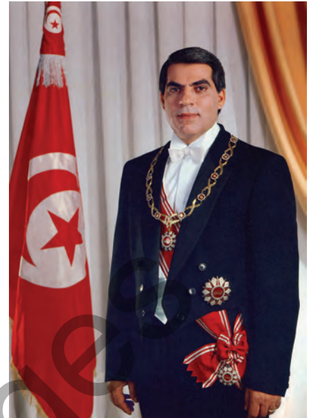
▲ Figure 2.2 President Zine El Abidine Ben Ali poses for an official photo in front of the Tunisian Flag, 1987

Ben Ali's immediate actions on taking power seemed to reflect a true commitment to the start of a new era. He described his coming to power as a historic change, portraying himself as a modernizer and reformer and gaining Tunisian and international support as a result (Figure 2.2).