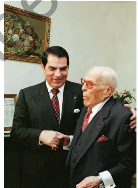
▲ Figure 2.4 President Ben Ali visiting former President Bourguiba at Monastir, May 1999, a few months before the October 1999 elections

Correctivist: A political or ideological stance focused on correction aimed at adjusting past mistakes, whether in governance, ideology or social structures.