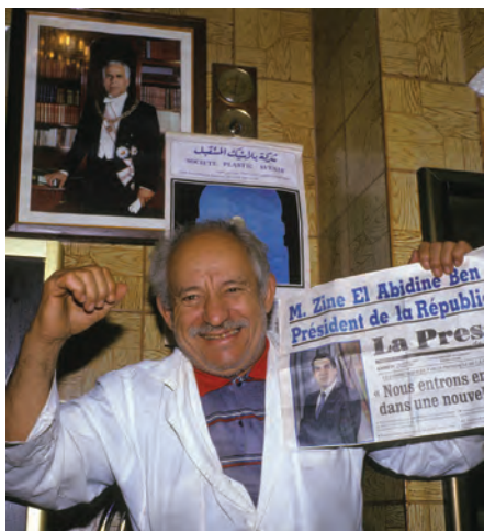
▲ Figure 2.1 A supporter waves the front page of a newspaper announcing the appointment of Ben Ali as the new President of Tunisia, underneath a picture of Habib Bourguiba, 7 November 1987

Ben Ali joined the Tunisian military in 1958 and was groomed as a future leader in the army receiving training at elite French and US military academies, specializing in military and police intelligence. His expertise in security operations helped him rise quickly through the ranks, leading to his appointment as Director-General of National Security in 1977. In 1986, he became Interior Minister and in October 1987, he was appointed Prime Minister.