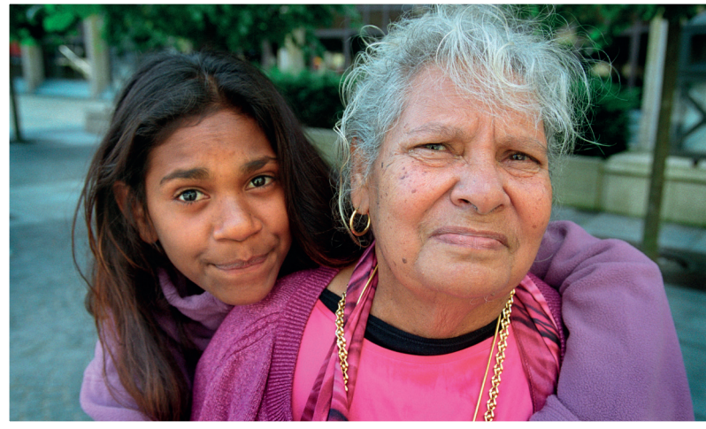
Doris Pilkington Garimara with Everlyn Sampi, who played the character of her mother Molly in the film The Rabbit-Proof Fence