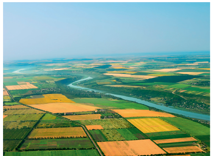
▲ Resources used to produce other goods and services include natural materials, people, machinery and land